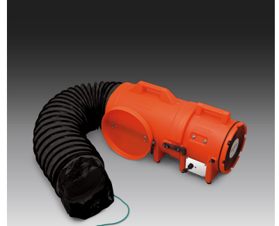
9538-E (Blower Only), 9538-15E, 9538-25E